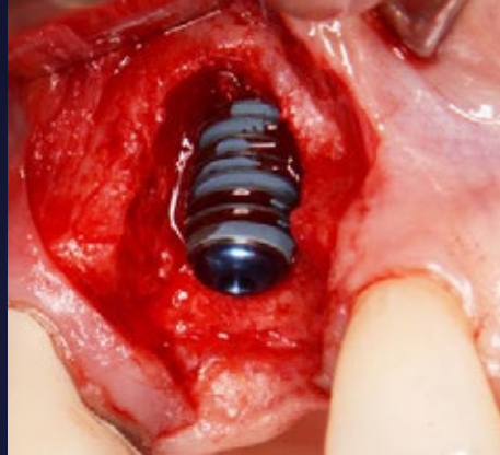
Implant placement & palatal graft