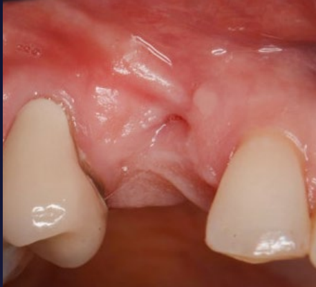
3 weeks healing post extraction