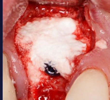
Simultaneous buccal graft