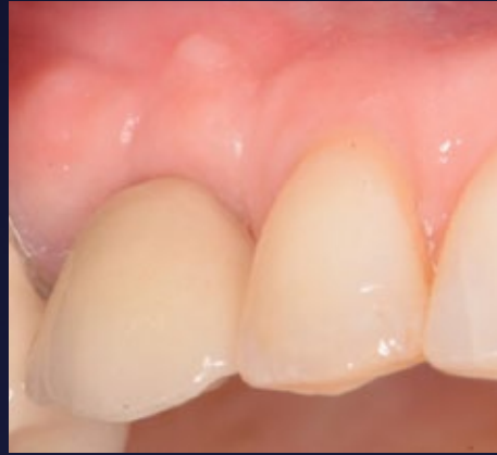
Loaded 1 year