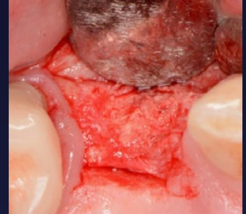
New bone formation at 12 weeks - grown over implant